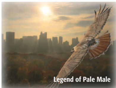
Legend of Pale Male