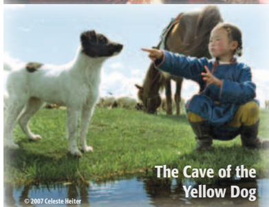
The Cave of the Yellow Dog