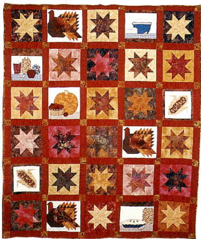
Batik Thanksgiving by Darsie Riccio of Woodstock

Space does not permit us to mention all the quilts that were entered, but they were lovely nevertheless, as were the friendly museum volunteers and quilters, who were demonstrating hand quilting at a quilt frame.