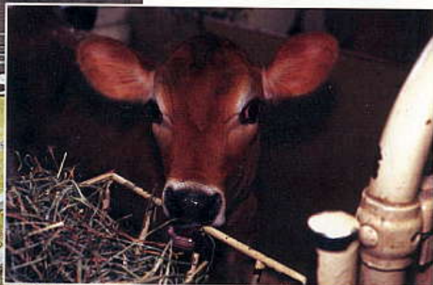
Jersey calf in the barn nursery