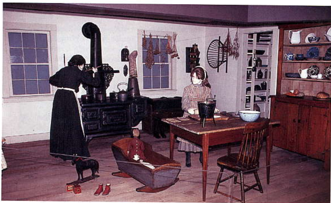
Example of an early farmhouse kitchen, located in the Farm Life exhibit

are three faucets: hot, cold, and "soft" (the soft water is good for laundering clothes). An indoor bathroom has the latest amenities that were available at the time of construction—tin tub, flushable commode, and a sink with hot and cold running water and a lovely floral-painted sink bowl insert.