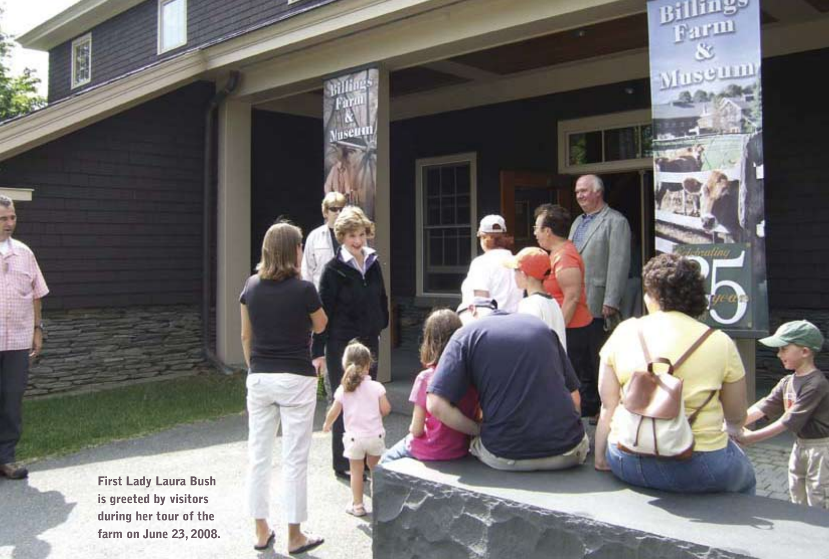
First Lady Laura Bush is greeted by visitors during her tour of the farm on June 23, 2008.