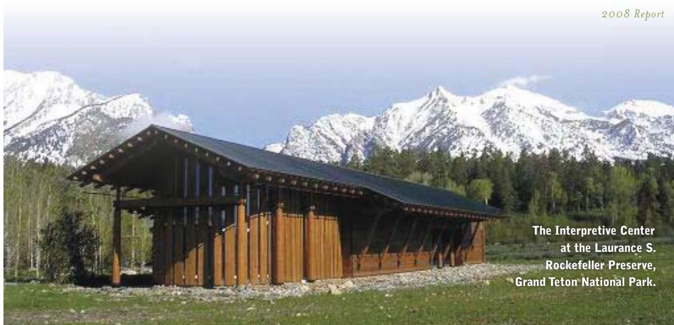
The Interpretive Center at the Laurance S. Rockefeller Preserve, Grand Teton National Park.