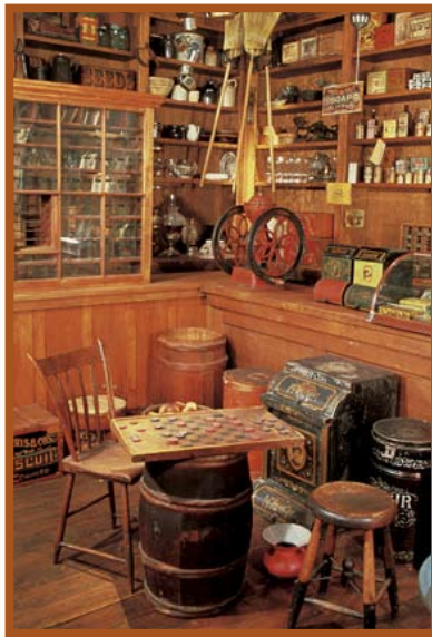
The general store exhibit.

The Billings Farm & Museum's project aims to revitalize the exhibit by adding authentic voices and stories from Vermont's past, bringing the exhibition alive, and making it a gateway experience that will inspire visitors to explore the Vermont countryside beyond their visit to the Farm & Museum. This is part of a larger "gateway initiative" that seeks to enhance the museum's mission to be a "gateway to Vermont's rural heritage." As a cultural gateway for the region, the Farm & Museum offers engaging experiences for tourists and residents alike, helping them to appreciate the cultural and natural richness of Vermont and inspiring them to be stewards of their own places, whether in Vermont or elsewhere.